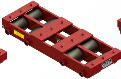
SRD-50 (steel rollers)